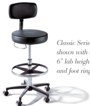
Classic Series 277 shown with optional 6" lab height extension and foot ring.