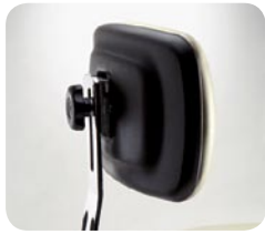
Classic and Value Series Backrest

For more information or a demonstration, contact your Ritter or Midmark Dealer, or contact Midmark Corporation, Versailles, Ohio. Call: 1-800-MIDMARK Fax: 1-800-365-8631 midmark.com