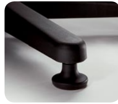
Value Series Glides