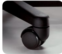
Value Series Soft Rubber Casters