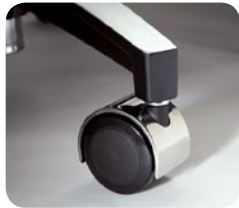
Classic Series Soft Rubber Casters