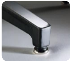
Classic Series Glides