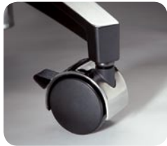
Classic and Value Series Locking Casters