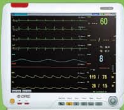
DRE Waveline Pro O.R. Monitor