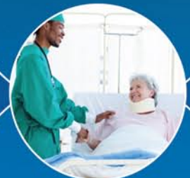
Bedside : Vital Signs