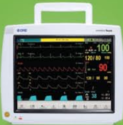
DRE Waveline Touch Patient Monitor