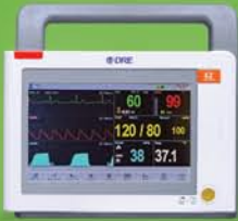
DRE Waveline EZ Portable Patient Monitor

Monitors | Anesthesia | Electrosurgical | Surgery Lights | Surgery Tables and much more