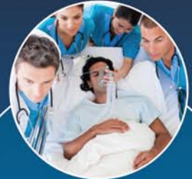
Transport : Emergency