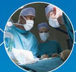
O.R. : Critical Care