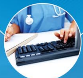
Central Station Monitoring