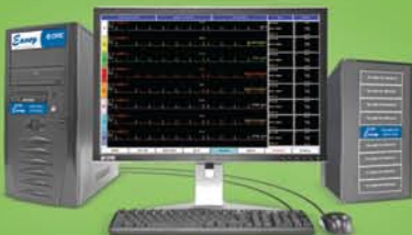
DRE Envoy TS Central Monitoring Station