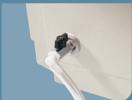
The external drain is very accessible and easy to use