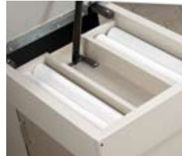
Paper Roll Storage