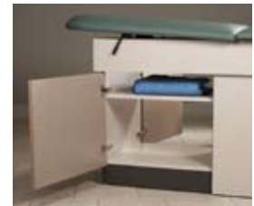
Both Sides Access