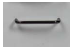
Black Wire 5B