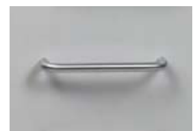
Silver Wire 5C