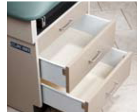
2 deep drawers