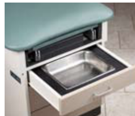
099 Optional Pull-Out Pan