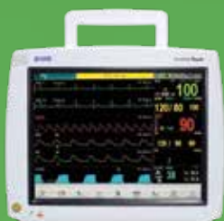
DRE Waveline Touch Patient Monitor