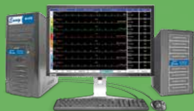
DRE Envoy TS Central Monitoring Station