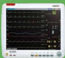
DRE Waveline Pro O.R. Monitor