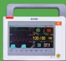
DRE Waveline EZ Portable Patient Monitor