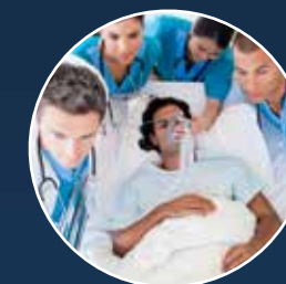
Transport | Emergency