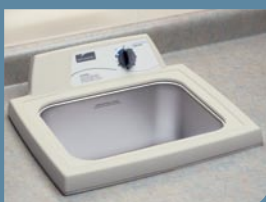
Recess unit for a lower profile