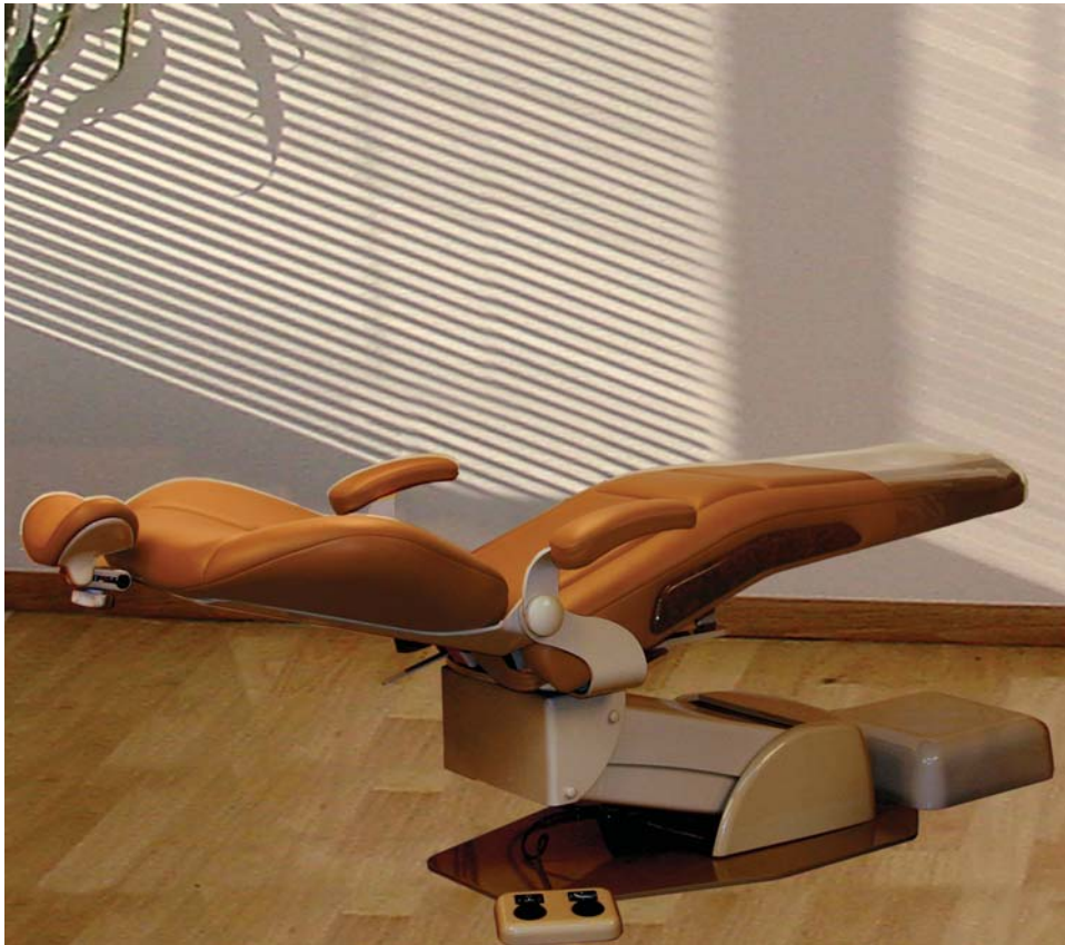
2001 Electro-mechanical Patient Chair (Shown with plush upholstery including trim)