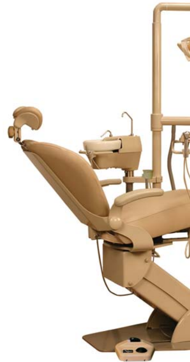
2001E Economy Patient Chair (Shown with optional Interceptor and Asepsis Upholstery)

2001E Economy Electro-mechanical with Asepsis Upholstery