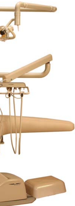
Patient Chair (International Package) (Upholstery)