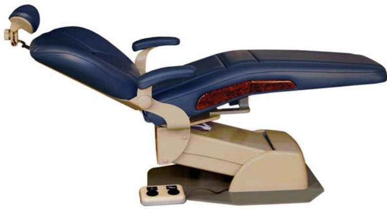
5000 Hydraulic Patient Chair (Shown with plush upholstery including trim)