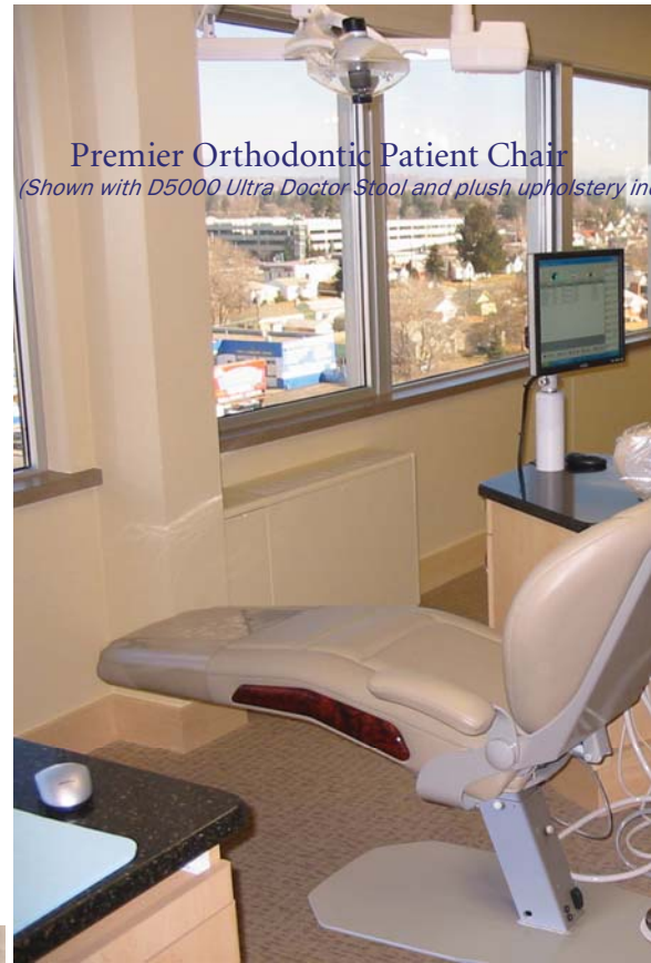
Premier Orthodontic Patient Chair (Shown with D5000 Ultra Doctor Stool and plush upholstery in Ultraleather)