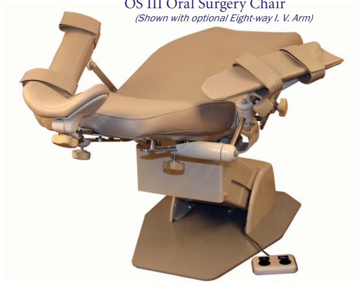
OS III Oral Surgery Chair (Shown with optional Eight-way I. V. Arm)

OS III Oral Surgery Chair with Standard Upholstery 2000-080-2