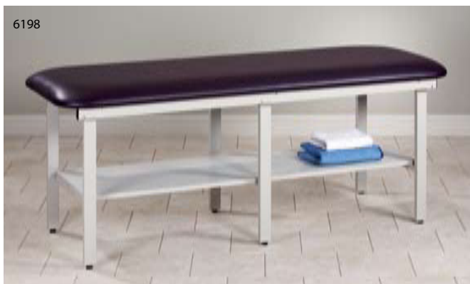
Bariatric Treatment Table