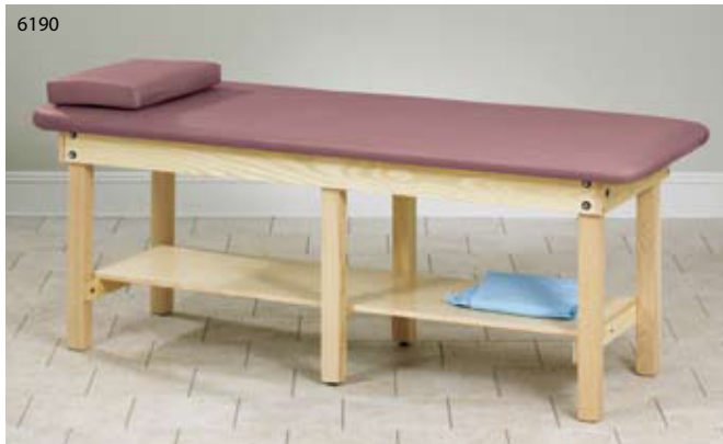
Bariatric Treatment Table