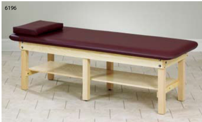
Bariatric Treatment Table/Low Height