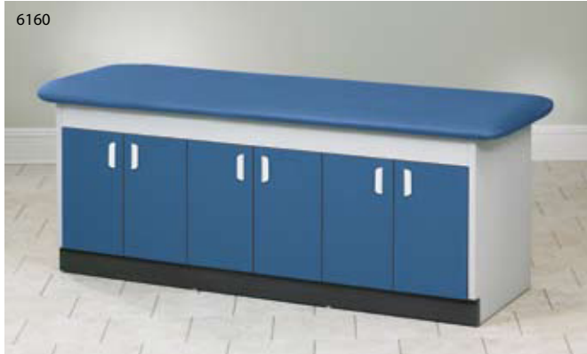
Bariatric Full Cabinet Treatment Table