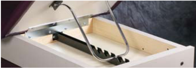
Pre-mounted heavy-duty, all steel adjustable backrest support system

Contemporary design and easy clean laminate surfaces highlight the ETA (Easy-To-Assemble) Style Line Series of tables. Its flat panel components use bolt-through, pre-threaded hardware for easy and secure assembly. Plus, Clinton's Style Line Series is available in 9 coordinated laminate and vinyl colors to complement any decor.