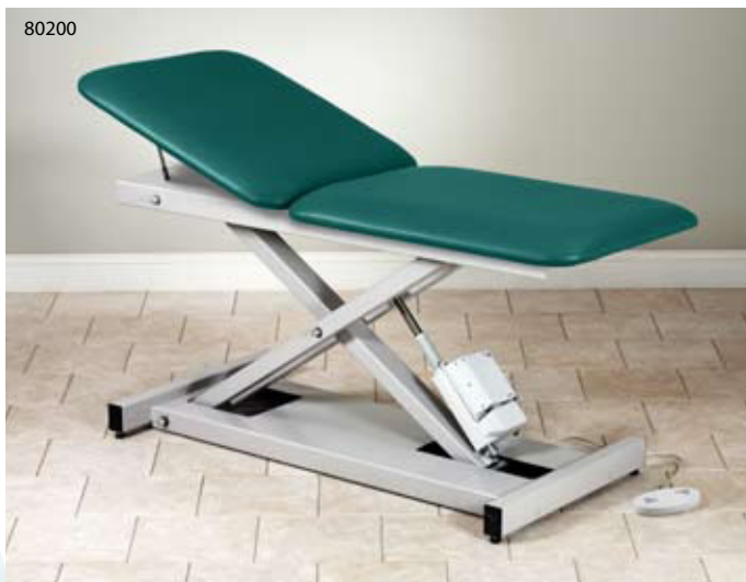
Power Table with Adjustable Backrest