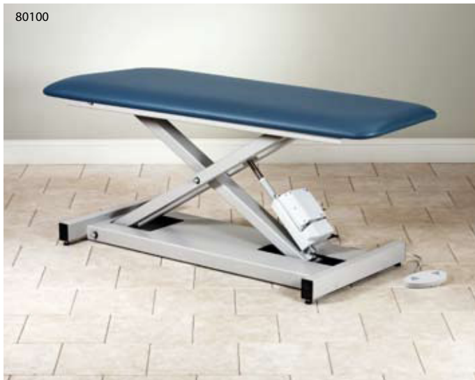
Power Table with One Piece Top