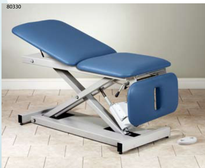
Power Table with Adjustable Backrest & Drop Section