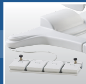
Moveable Arm Rests