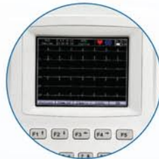
Bright color screen