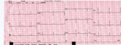
12-lead ECG waveform