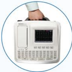
Portable and compact