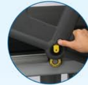
Push button rotating cot sides