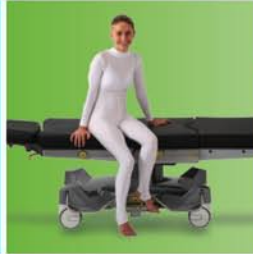
Adjustable Height Low: 24" High: 40"