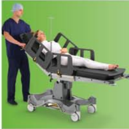
Patient Transport Moves patients through the endoscopy unit.