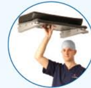
Removable ultra lightweight leg section