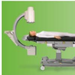
C-arm Access Powered version: 100% Manual version: 75%