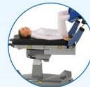
Accessories available for alternative positioning