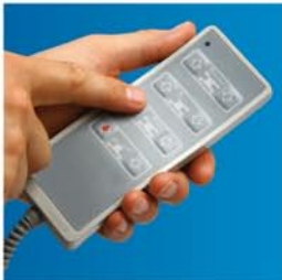
Remote Control Powered version only.