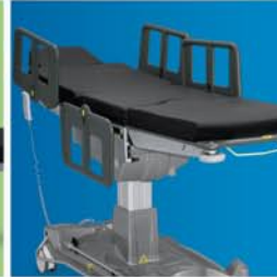
Four Independent Safety Rails You can keep the shoulder rail in place for patient support, and lower the hip rail for access to the patient.