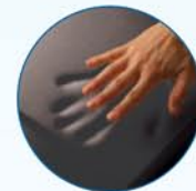
Mattress conforms to patient for increased comfort