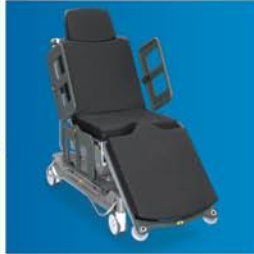
Chair Positioning Provides patient comfort during recovery.