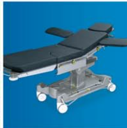
Surgery Table Positioning Built-in