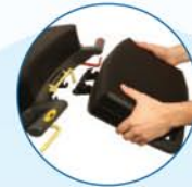
Removable Head Section