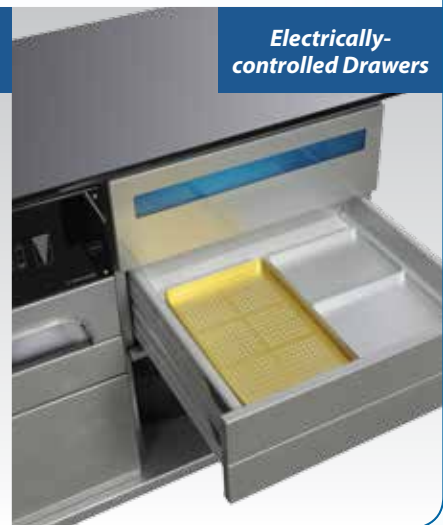
Electrically- controlled Drawers