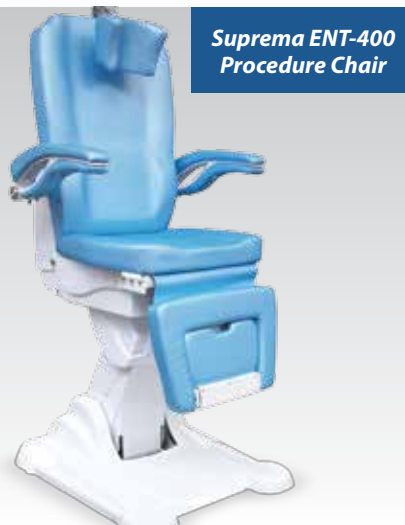
Suprema ENT-400 Procedure Chair